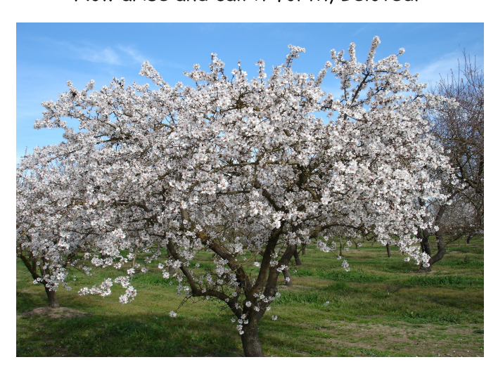
Veils and Tombs...

Still meditating in the subject of death and resurrection, I came upon a portion of scripture in Matthew: